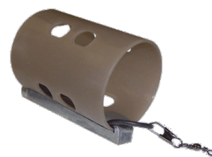
Open End Feeder