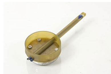
Banjo Feeder Elasticated