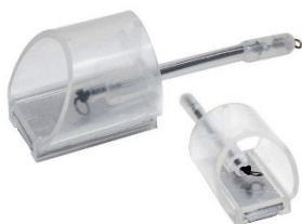
Pellet Feeder Elasticated