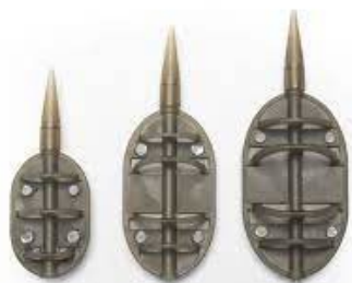
Flat Method Feeder